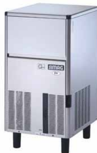
Self Contained Solid Ice Cube IM0043SSC