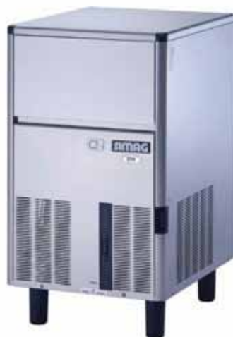
Self Contained Solid Ice Cube IM0032SSC